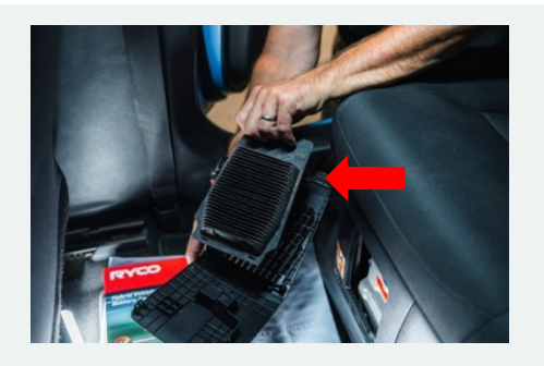
STEP 6 Repeat above steps in reverse to re-install OEM battery air filter housing flap.