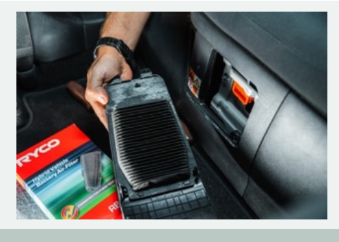
STEP 5A Once flap is released, remove old battery filter by releasing the filter from the tabs holding it in place by pulling away from OEM housing flap. Then install new battery air filter in same orientation as old filter was installed.