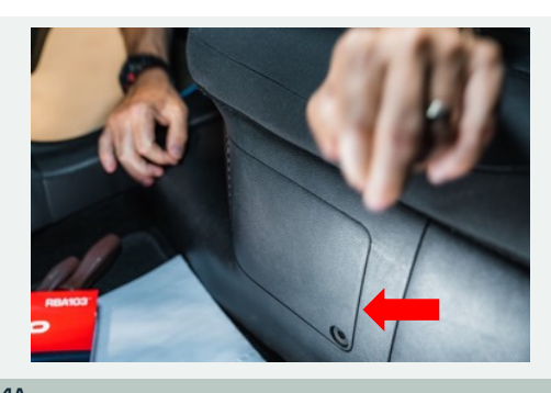
Using flat head screw driver or hands, wedge in-between around perimeter of battery filter OEM housing flap and back seat to begin removal of housing flap - then gently pull open flap to release remaining tabs.