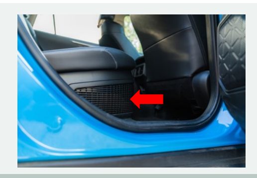
STEP 1 Location of battery air filter is on drivers side, underneath rear passenger seat.