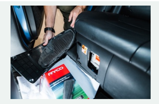
STEP 5B Once flap is released, remove old battery filter by releasing the filter from the tabs holding it in place by pulling away from OEM housing flap. Then install new battery air filter in same orientation as old filter was installed.